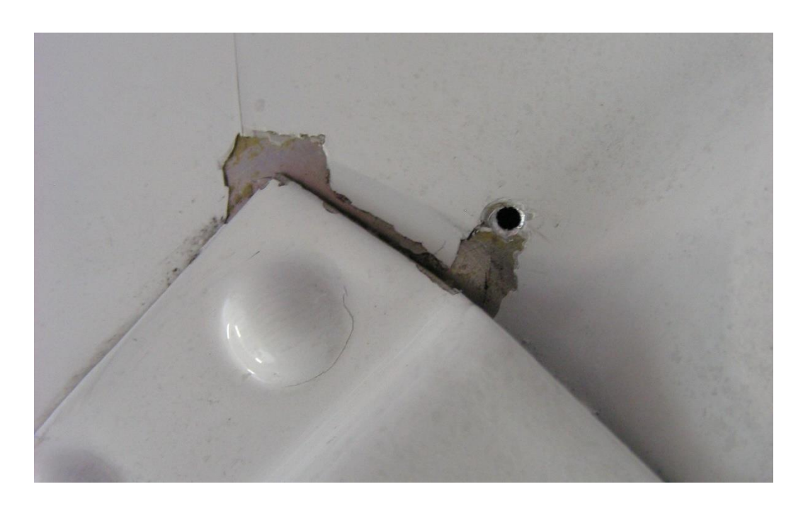
Fig. No. 2