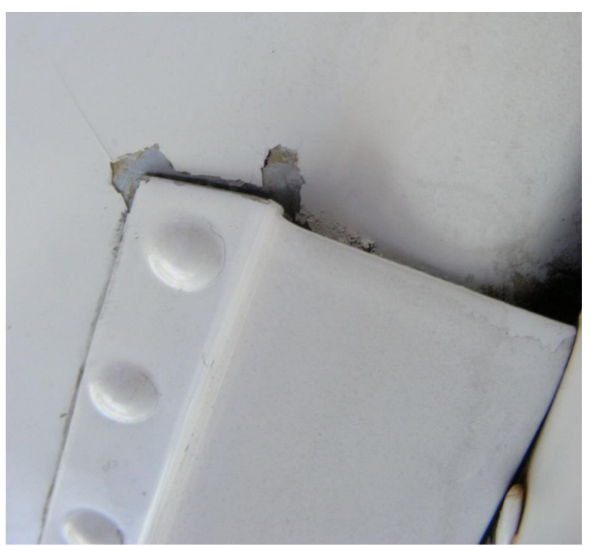
Fig. No. 1

The reported findings were considered by the Commission of Airworthiness and Reliability of ZLIN AIRCRAFT a.s. and its conclusion is that the cracks are repairable with no impact on airplane's airworthiness: